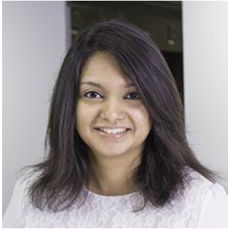
CORAL PAIS, PE, BEMP